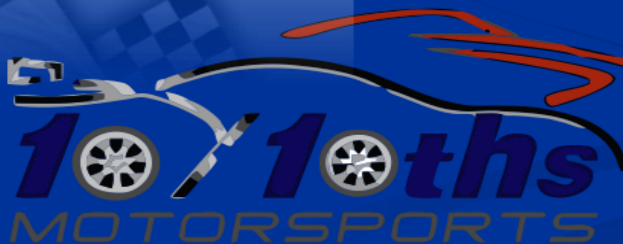
FINISH LINE! CHECKERED FLAG