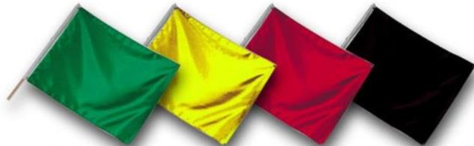
GREEN FLAG GO!